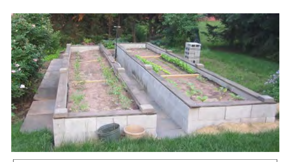
Due to the grade, the third course is under ground in the front while above ground in the back of the raised beds.

Did the benefits outweigh the expense and effort? Absolutely!! I originally calculated that it would take seven years of produce value to repay the cost of the construction. After the first year, I've decreased the time to three years.